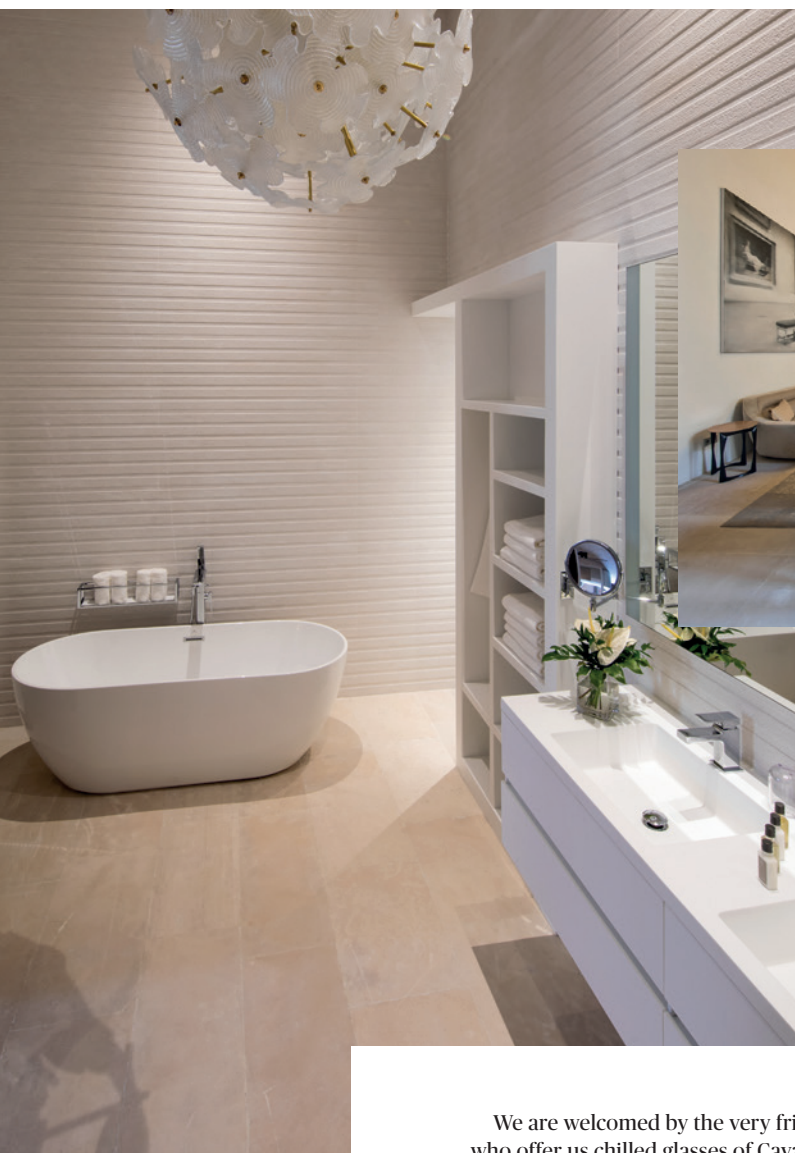
Built as a palace in the 18th century, Palacio Can Marqués has been painstakingly renovated and now offers opulent but unpretentious accommodation in the heart of Palma